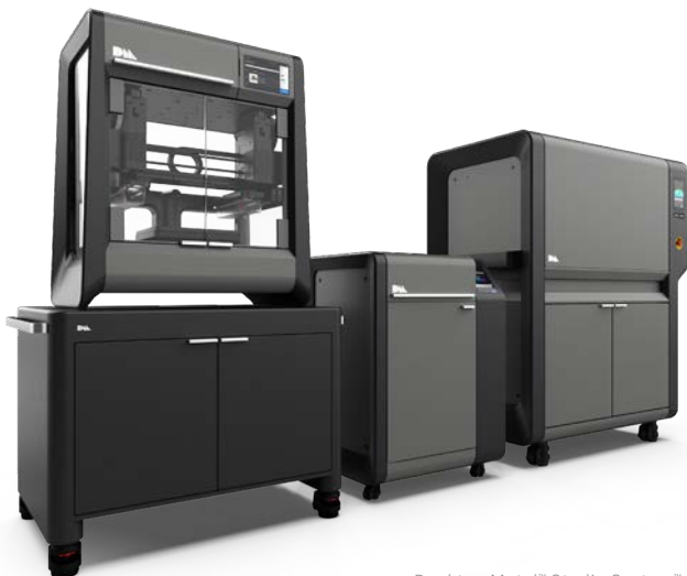
Desktop Metal™ Studio System™

With the development of the Studio System™, though, Desktop Metal is addressing those issues and more - making it both easier and more economical to create functional prototypes.