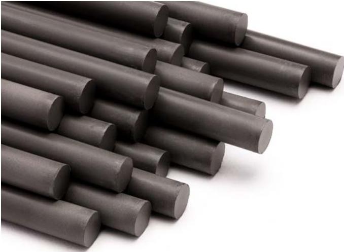
Desktop Metal BMD™ Rods

The key technology behind the Studio System™ is Bound Metal Deposition™ - an FFF-style print process that heats and extrudes a rod media made of metal powder and a polymer binder, similar to the media used in metal injection molding (MIM).